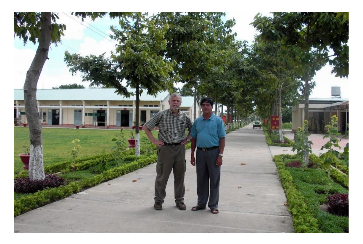
Deputy Base Commander near what used to be our enlisted men's area

I was allowed unrestricted access to anything I wanted to look at. So much had changed that the only readily recognizable feature was the runway. It was in good shape but mid-way there was a reviewing stand so I doubt that any fixed-wing aircraft could land unless the stand was moved. There were no helicopters of any kind visible, not even a hangar. I was informed that the base was now home to a mechanized infantry division, complete with our old M113 APCs. They looked good with new paint but I didn't see any in operation.