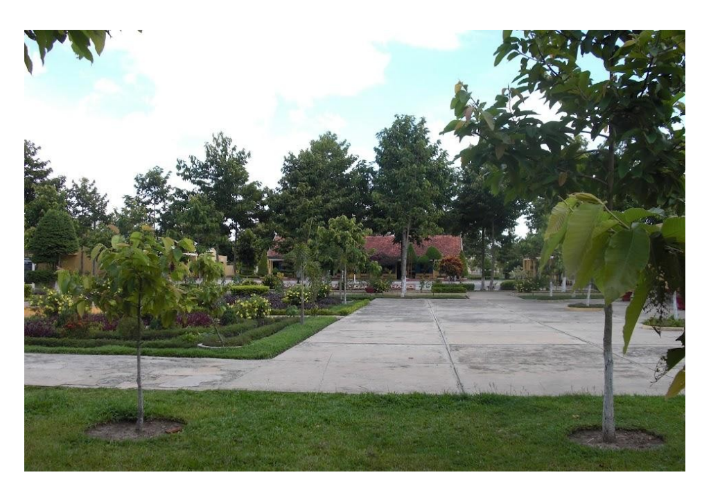
Looking east in the direction of the 187th enlisted men's hootches. It is still part of the enlisted men's quarters but only a small part.