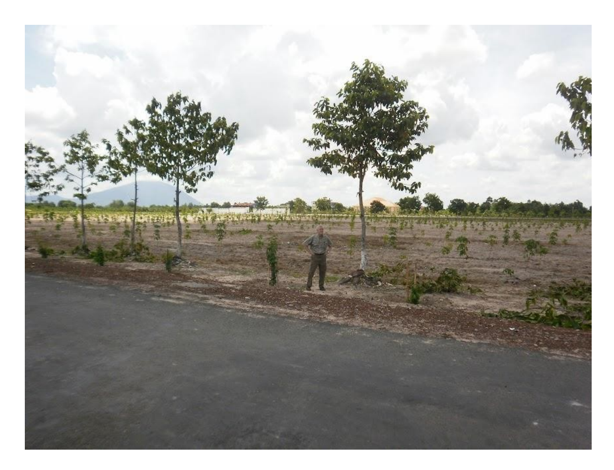
The flight line has been cleared and planted with rubber trees and there were no revetments remaining.