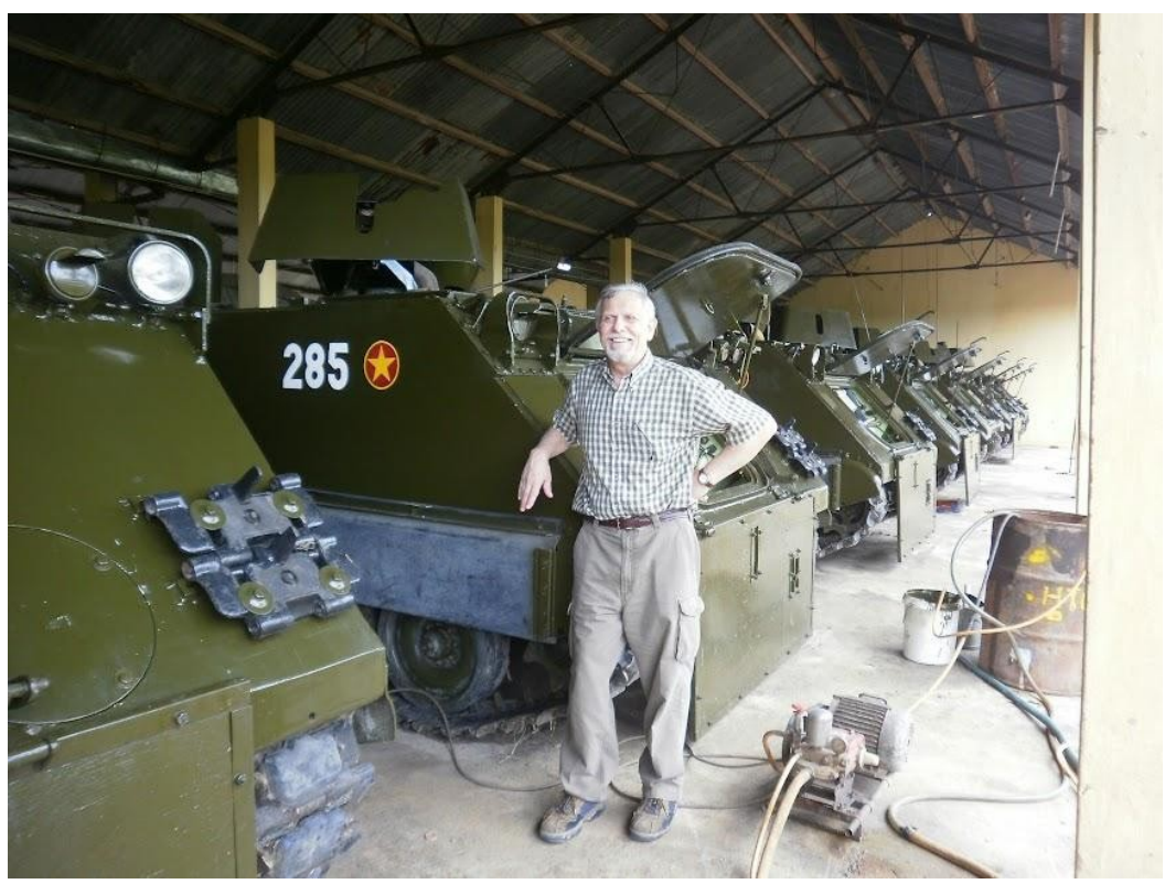
Several of our M113s