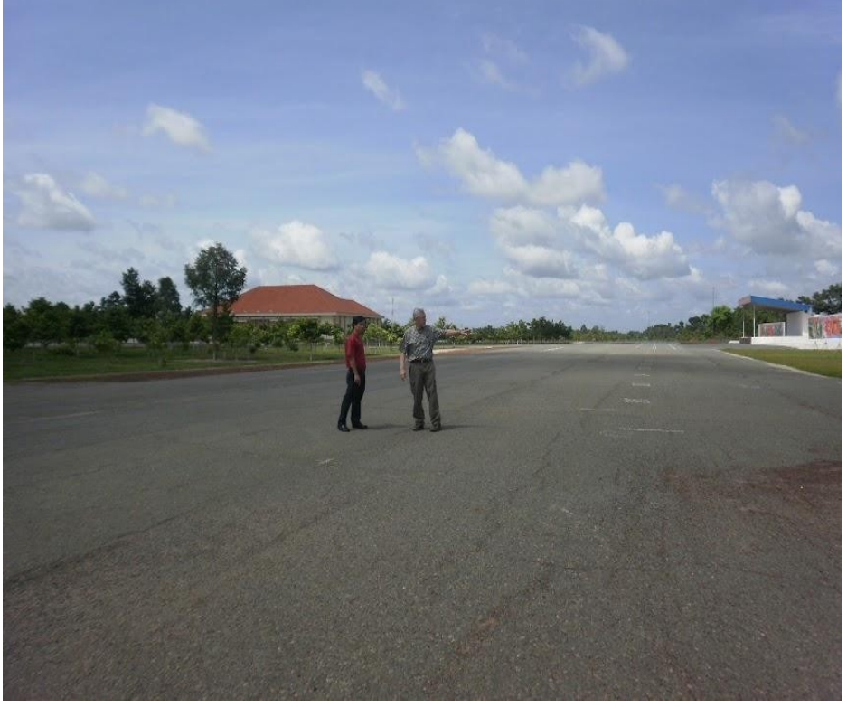
The main runway looking west with the reviewing stand on the right and the current headquarters on the left; I'm pointing towards the 187th Company area.