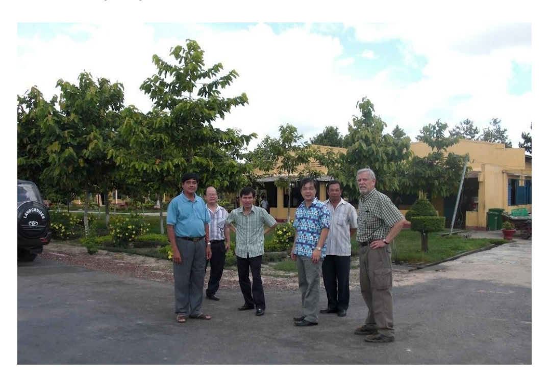
As it was in our time, this is the area of the current officer's quarters. Quite a change.

I couldn't find a single sign that I could attribute to our involvement in the area.